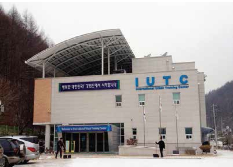
► International Urban Training Center (IUTC), Republic of Korea